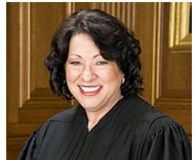
Supreme Court Justice Sonia Sotomayor

— National Right to Life News, December 2, 2021